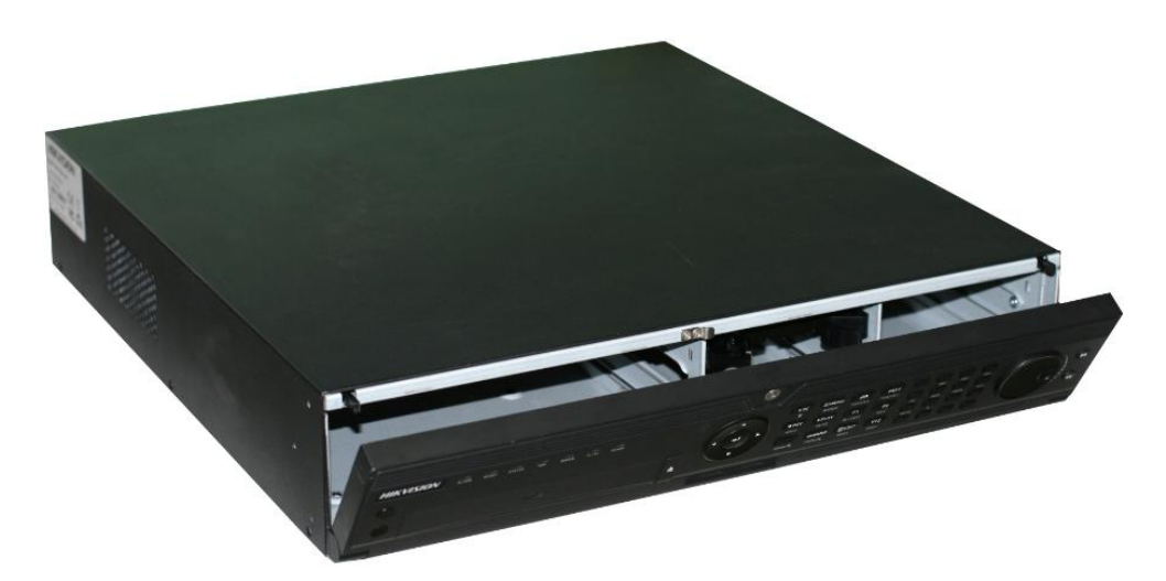
DS-9100HFI-RH Embedded Net DVR