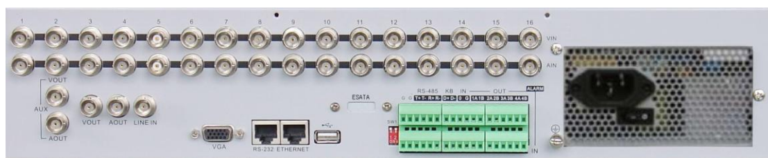
DS-8016HCI-S Rear Panel